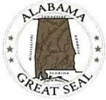
Kay Ivey Governor