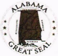
Kay Ivey Governor

216 AQUARIUS DRIVE, SUITE 319 HOMEWOOD, AL 35209 PHONE (205)945-4857 FAX (205)945-9915 www.pgfb.alabama.gov