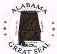
Kay Ivey Governor

216 AQUARIUS DRIVE, SUITE 319 HOMEWOOD, AL 35209 PHONE (205)945-4857 FAX (205)945-9915 www.pgfb.alabama.gov